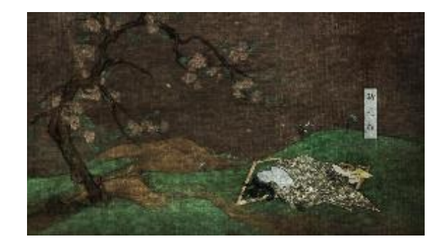
張立人 · 古典小電影系列 14 九相劇 · 2015 動畫裝置