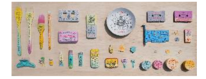
林書楷 · 陽台城市文明系列-喃喃齊物誌:再生文明 · 2022 複合媒材 110 x 50 x 100 cm