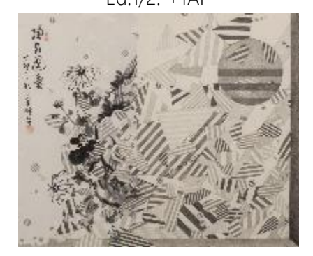
劉文瑄·對畫京都:蘭畦 #3·2016 鉛筆畫、京都跳蚤市場的水墨畫、楮皮紙 39.5 x 32.5 x 3.5 cm

繪畫 160 x 120 x 5 cm 錄像 Full HD, 8' 00' ' Ed.1/2, +1AP