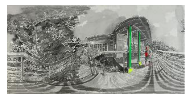
黃琬玲 、台灣十二勝- 北投草山 、2022 墨、京和紙、壓克力、牛三千本膠 85 x 169 cm