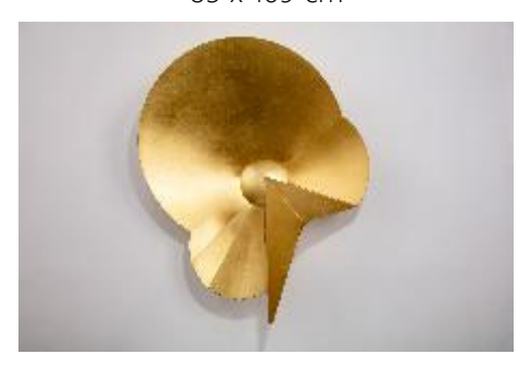
歐立婷・光Ⅱ・2022 黃銅、蠟 66 × 52.5 × 17.5 cm